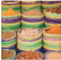
Shopping at the Khan el-Khalili Market; spices for sale in Cairo; sunrise at the Pyramids of Giza;